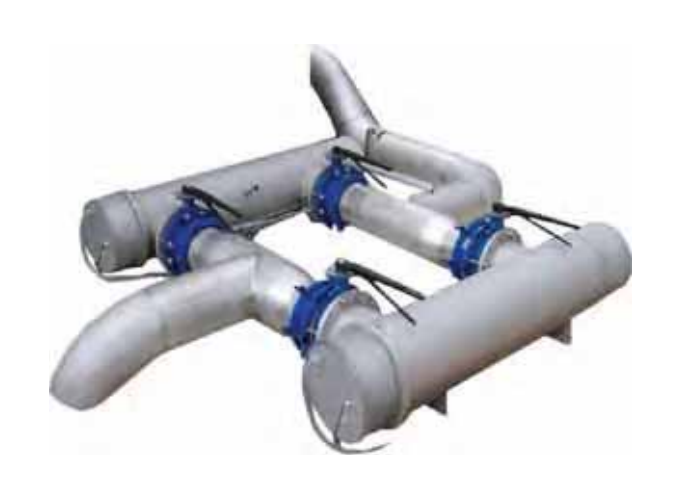
▶ LBT range for waste water treatment