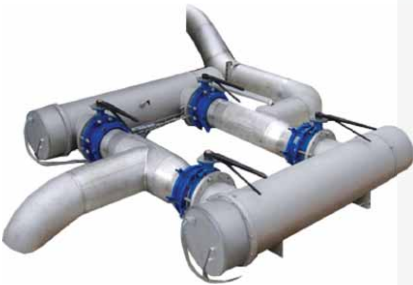
► LBT range for waste water treatment

SANIPRO keeps diversifying its activities in the hygienic industry.