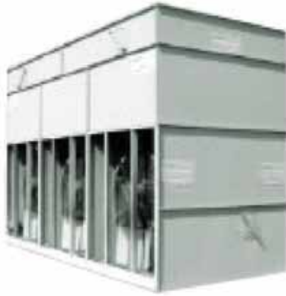
► Legionella prevention inside cooling towers

Air is one of the main vehicle of viruses and bacteria. This is the reason why, sterilization of conditioned air inside public place is very important in order to prevent the diffusion of diseases.