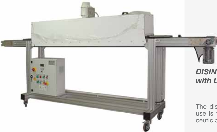
► SANIPRO UV Tunnel for the sterilization of surfaces